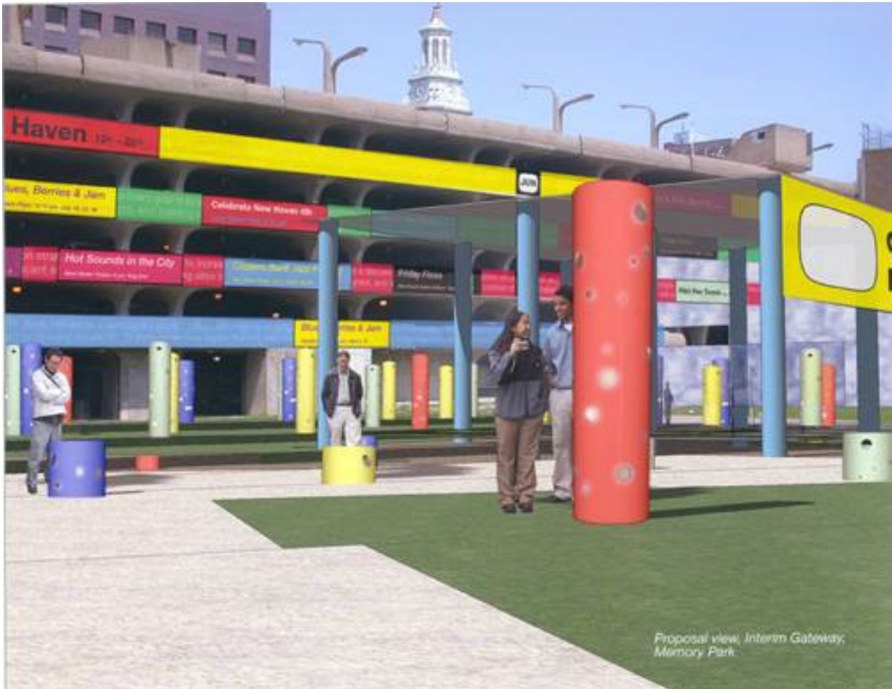
Photographer: Dean Sakamoto Architects

Jury Comments: A very intelligent urban design strategy was proposed here. It consists of a systematic way of treating differing site conditions, and an understanding of New Haven's urban history. If it is eventually implemented, it would produce a better street. It is very down to earth, modest, sufficiently adaptable, offers ways to deal with empty buildings and vacant lots and could easily be implemented.