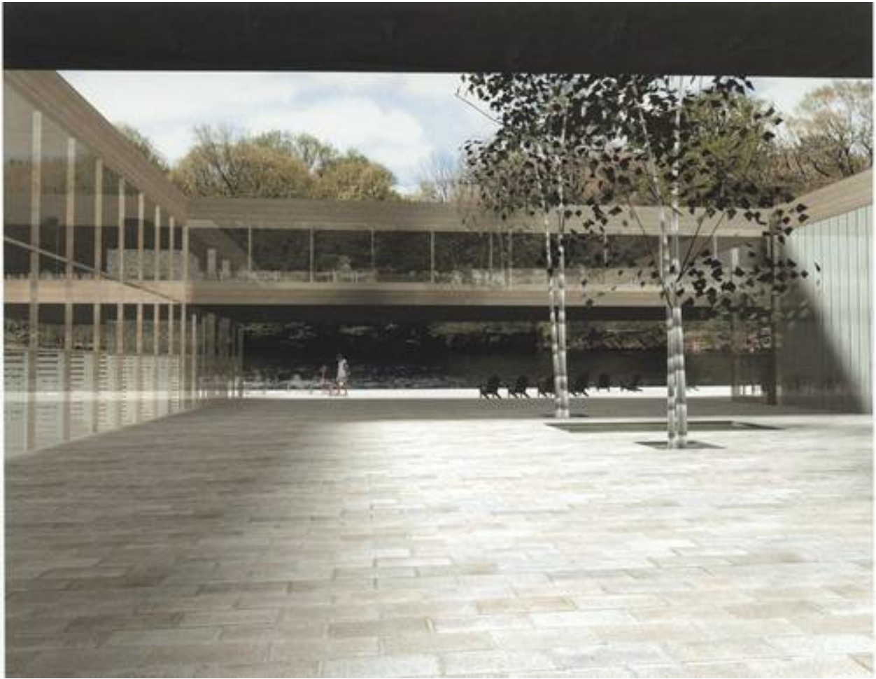
Photographer: Skidmore, Owings & Merrill, LLP

Jury Comments: The jury admired the use of the modern idiom for a building type that usually yields a historicist solution, i.e., the Newport Tennis Casino. It makes a strong reference to a well established, contemporary European model, but puts it to a good new purpose.