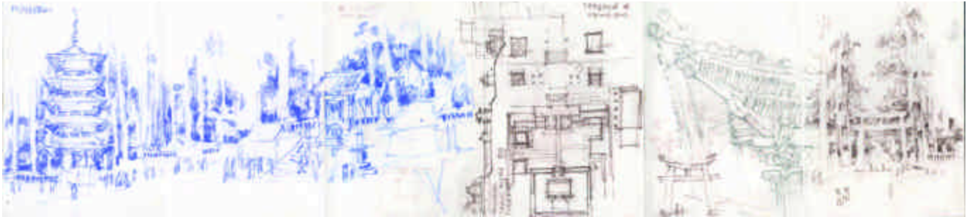
Crayon, Pen and Ink