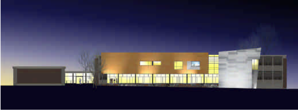
Digital Mixed Media