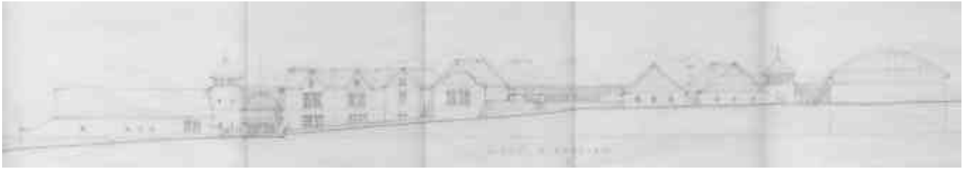
Pencil on trace