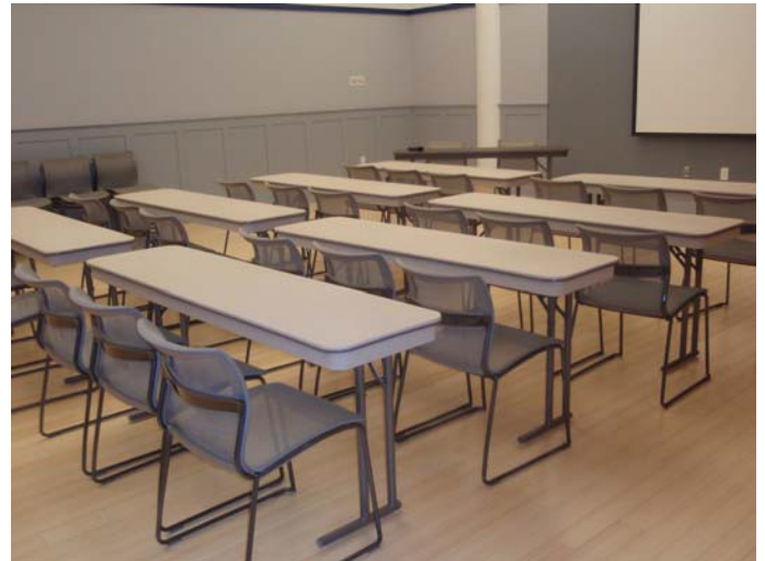
Training Room Classroom Style