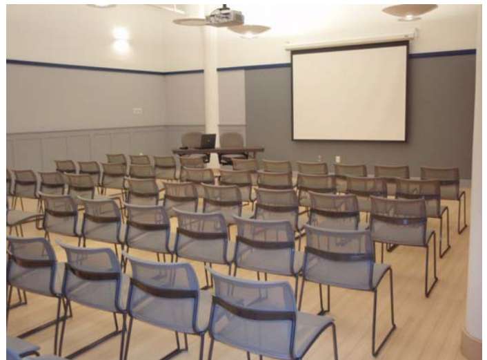
Training Room Theater Style