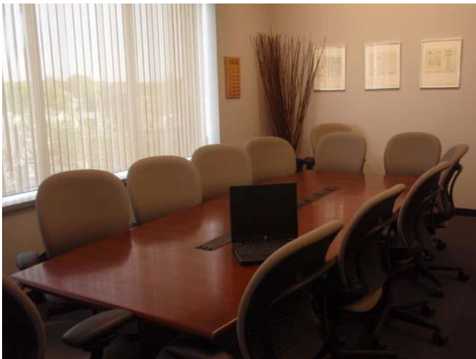
Conference Room (15 person capacity)