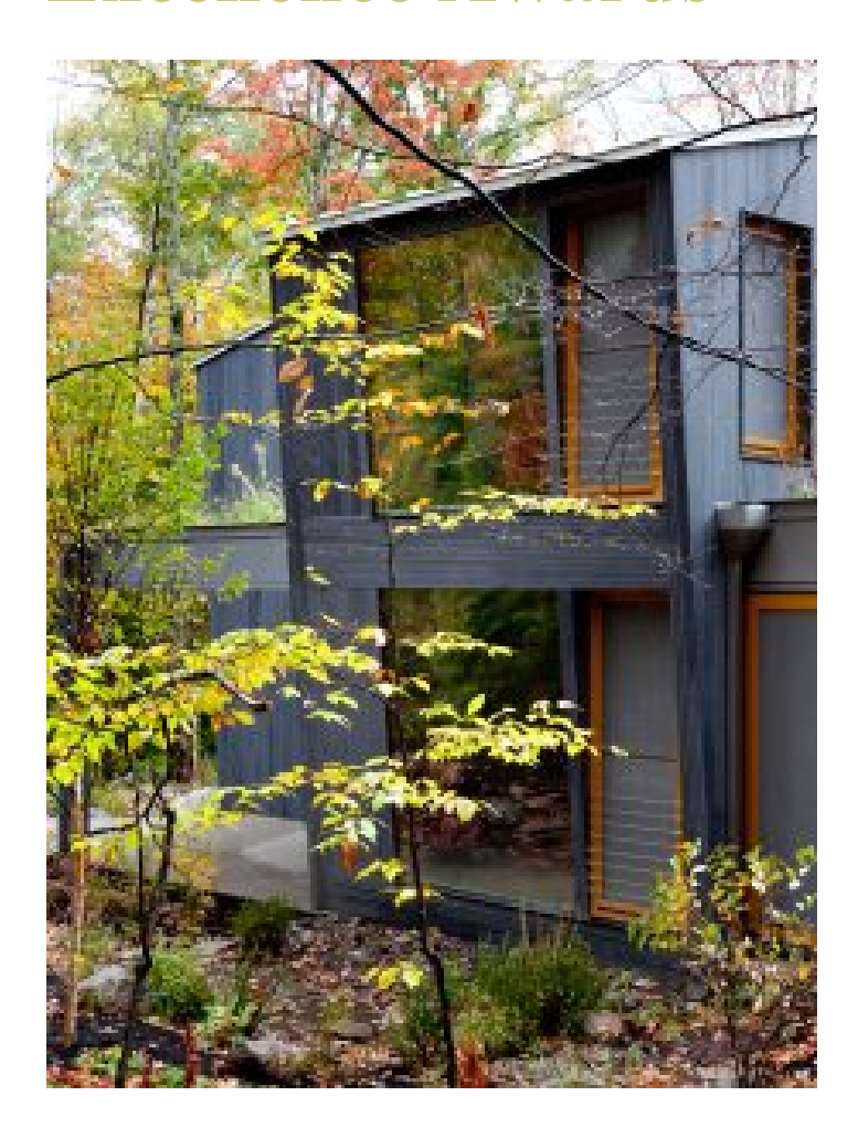
Adirondacks House Gray Organschi Architecture, New Haven CT

Jury comments: This project fits beautifully into the landscape. The spatial layout is well organized, accommodating sleeping for 14 in a relatively compact footprint. The exterior materials continue into the interior providing spaces that are warm and durable. The interior is light filled. The ramp and stair provide a very nice moment in the project.