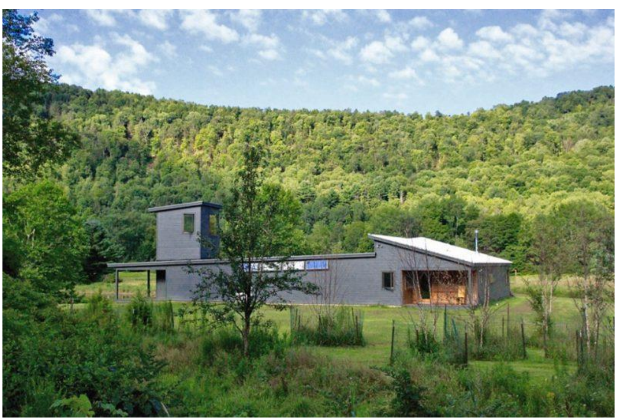
East Branch House / Turner Brooks