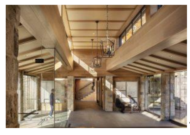
The Greenwich Historical Society

Connecticut's Cos Cob Landing was the "cradle of American Impressionism." In the late-19th/early-20th century, renowned artists summered at its National Historic Landmark, Bush-Holley House immortalizing the bucolic setting and structures in their art. By the mid-20th century, changing demographics, development, and modern roadways eroded this important artistic precinct. Greenwich Historical Society saved and restored the Bush-Holley landmark as their headquarters but had little space for expanding needs and interpretive programs. To accommodate growth, the Society gradually acquired ailing adjacent structures, and in this project revitalized them as a cohesive historic campus; including adaptive-use restoration of "Toby's Tavern," as well as the construction of a new archives/gallery complex inspired by former dependencies, depicted in artworks by the Impressionist art colonists. Placement of these structures now buffers and screens this National Historic Landmark from neighboring I-95 furthering the Society's mission and reestablishing the place that inspired a generation of American art.