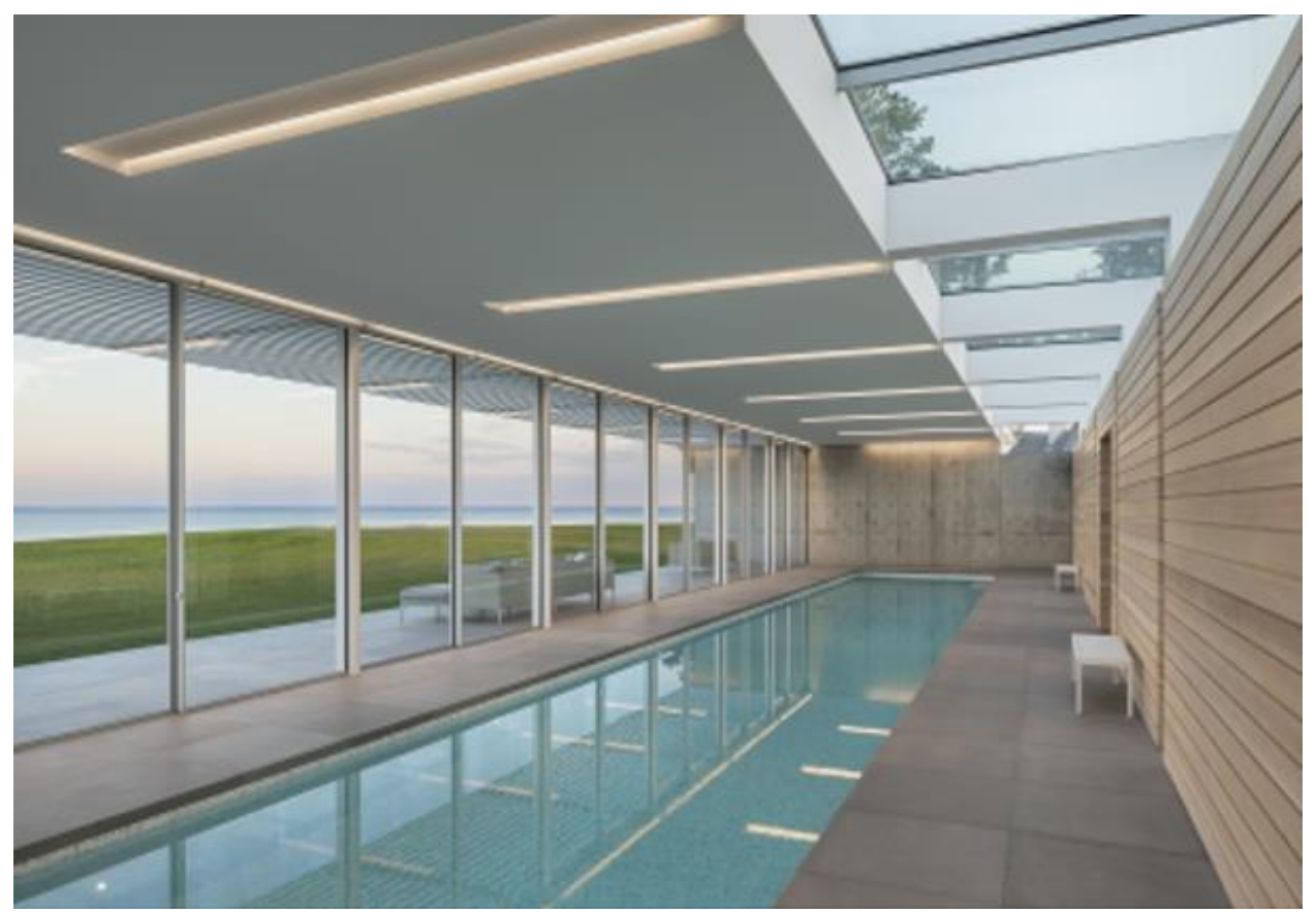
Pool House / Roger Ferris + Partners