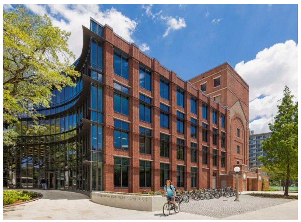
Goldring/Woldenberg Complex, Tulane University / Pelli Clarke Pelli

A.B. Freeman School of Business is comprised of two buildings, Goldring/Woldenberg Hall I and Hall II, located on McAlister Drive, a busy pedestrian path in the heart of Tulane University's campus. Pelli Clarke Pelli Architects' design unifies the two buildings into one academic complex with a new 46,000-square-foot, four-story addition and a 46,000-square-foot renovation of a classroom, two auditoriums, and two lecture halls. Inspired by Tulane's mascot, the Wave, and large oak trees lining McAlister Drive, the scalloped pattern of the four-story glass curtain wall entrance activates and, at night, illuminates both the outside courtyard and central atrium inside, becoming a vibrant gathering place for students throughout the day and evening.