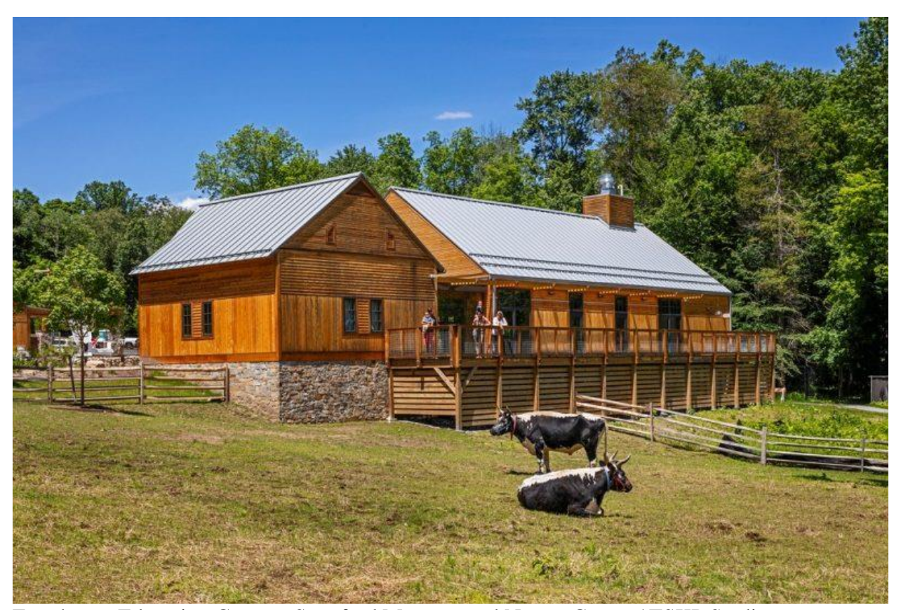
Farmhouse Education Center - Stamford Museum and Nature Center / TSKP Studio

The Farmhouse Education Center is the first education building addition to the 118 acre Stamford Museum and Nature Center in 50 years. The Education Center provides educational spaces, visitor services and a new entrance to the Farm museum. It includes: a 1,600 sq. ft. multipurpose space with commercial kitchen and an open deck overlooking an existing paddock, a Maple Sugar and Cidering House, expanded parking, additional paddocks and outdoor gathering spaces such as the Farmhouse plaza, the Grove plaza with fire pit and boulder seating, and an outdoor classroom.