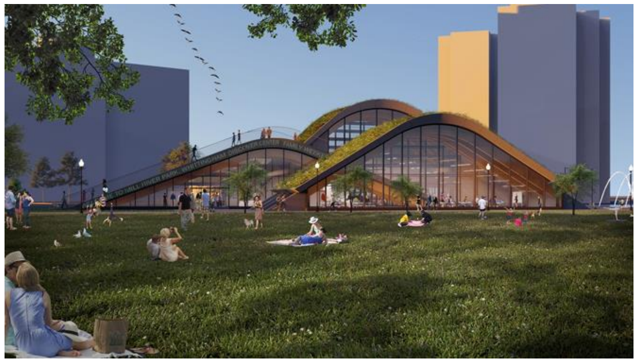
Mill River Park Discovery Center / JCJ Architecture

As part of an effort to reclaim and rehabilitate 28-acres of blighted parkland in the heart of downtown Stamford, the Mill River Park Collaborative (MRPC) issued an RFP for a new facility that would function as an interactive learning and development center for educational programs in the park. The MRPC indicated the project's form must be such that it can be considered a work of art. In addition to creating a place of enduring appeal that engages and holds the eye of the observer, the building would include facilities to interactive exhibits, functional classrooms/labs, support areas for an adjacent ice skating rink, carry out café, office and support spaces for employees.