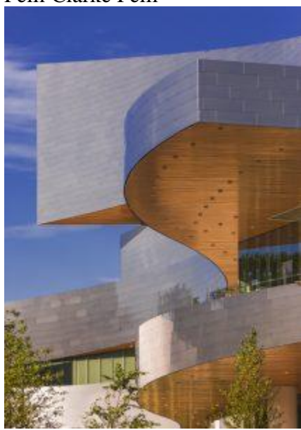
Pelli Clarke Pelli

Hancher Auditorium, Iowa City, Iowa, Architect: Pelli