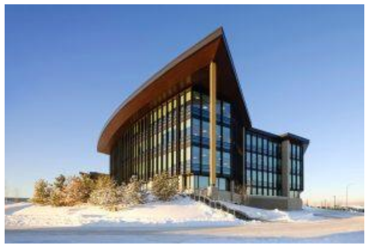
ATCO Campus / Pickard Chilton

Located in Calgary on a former brownfield, the ATCO Campus is a new headquarters for the energy and logistics company that brings the ATCO family closer together while providing neighbors and customers with a beautiful place to gather and enjoy the rehabilitated landscape. The campus is a dynamic composition of two four-story office buildings, interconnected by the Commons, a central boat-shaped multi-purpose facility. The LEED NC-Gold buildings provide panoramic views to the Rockies and the Calgary skyline. The first floor of the parkade creates a plinth upon which the buildings and quad are sited.