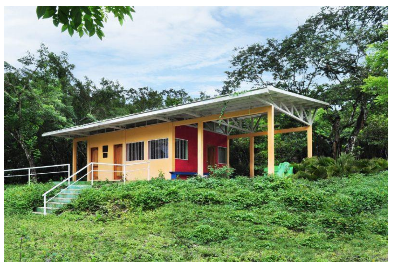
Clinica Verde/Amanda Martocchio Architects

"It takes a village!" is a true statement regarding the design and construction of a prototype for a rural health clinic in Las Lagunas, Boaco, Nicaragua. In fact, it took the active collaboration of members of this remote village; Clinica Verde, an NGO that delivers high quality medical care and health education focused on pregnant mothers; the Nicaraguan Ministry of Health; and Amanda Martocchio Architects Connecticut-based studio. They were asked to create a "Puesto de Salud" prototype for providing compassionate healthcare in rural communities throughout Nicaragua, within an environmentally and socially sustainable framework. Las Lagunas was the first community where the prototype was built.