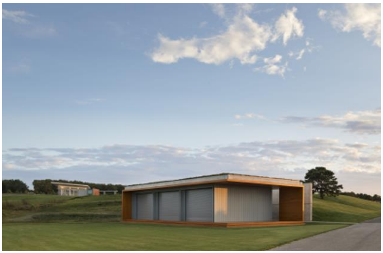
The Bridge Golf Teaching Facility / Roger Ferris + Partners