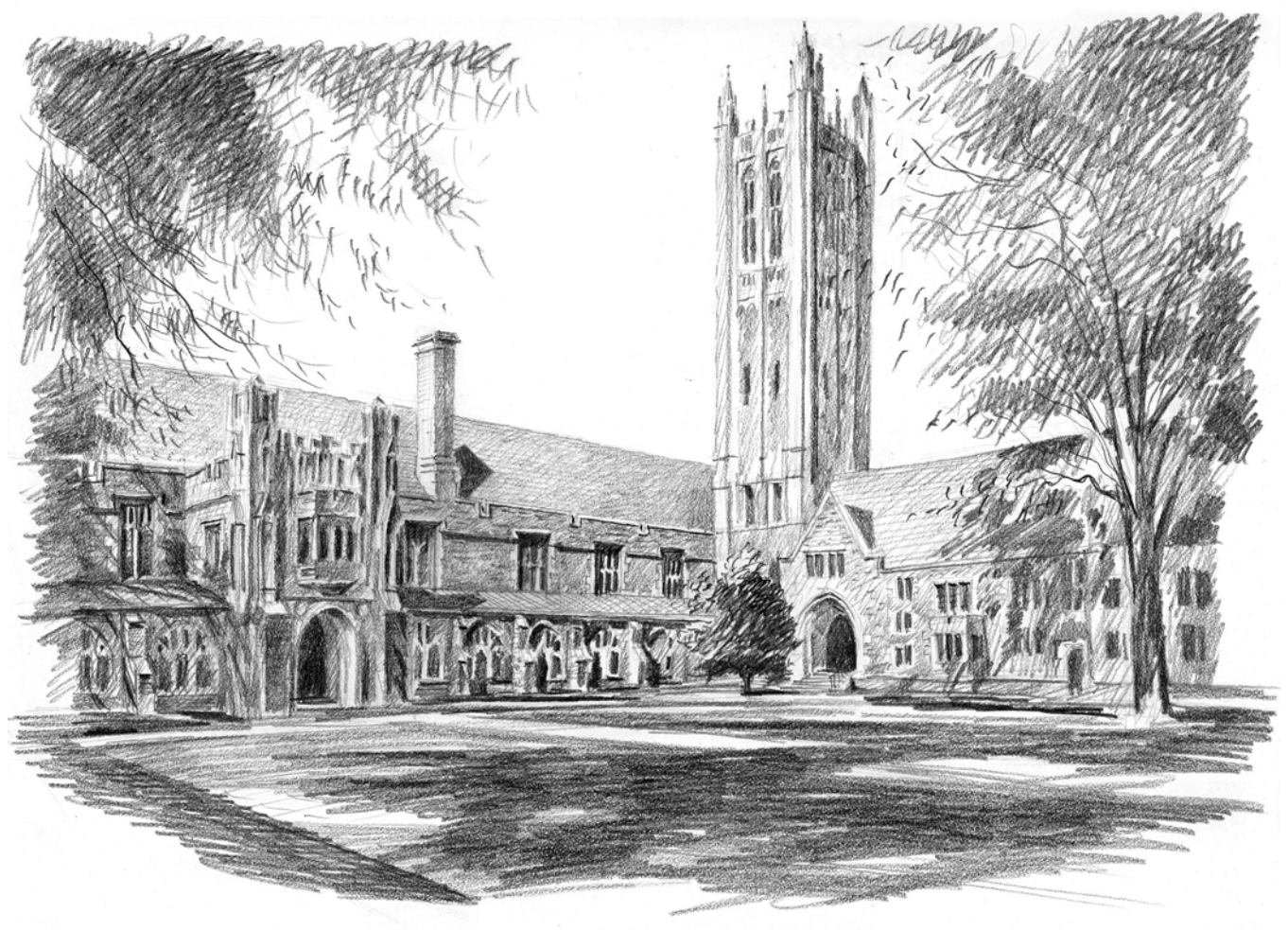
Pencil Drawing, Holder Court, Princeton