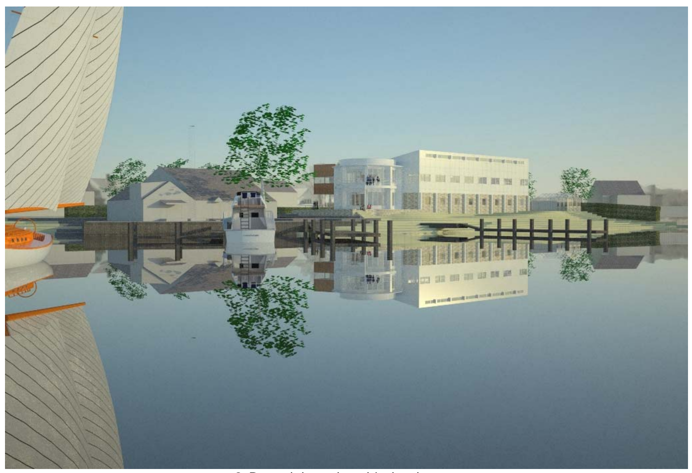
3-D model rendered in landscape

Richard Herzer, AIA The S/L/A/M Collaborative, Glastonbury, CT